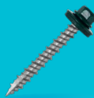
Fastgrip™ #10 Hi-Lo