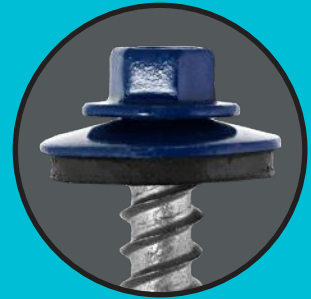
EPDM Bonded Washer