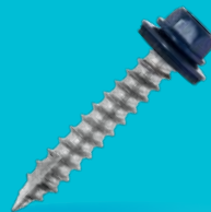
Fastgrip™ #14 Hi-Lo